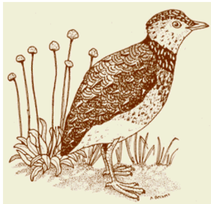
Plains Wanderer ( Pedionomus torquatus ) (Illustration by Alexis Beckett)