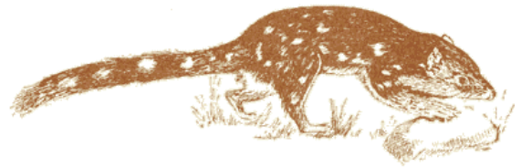
Spot-tailed Quoll ( Dasyurus maculatus )

The Spot-tailed Quoll (or Spotted-tailed Quoll or Tiger Quoll, Dasyurus maculatus ) is the largest marsupial carnivore on mainland Australia. Males have a head and body length of 380-760 mm, a tail length of 370-550 mm and weigh up to 7 kg (average 3 kg), while females have a head and body length of 350-450 mm, a tail length of 340-420 mm and weigh up to 4 kg (average 2 kg). Fur colour ranges from light to very dark brown, with conspicuous white spots over the body and tail. No other quoll species in Australia has a spotted tail. The Spot-tailed Quoll has a relatively large head with a wide jaw gape and characteristic large dentition of a carnivore, including long, curved canine teeth (Edgar and Belcher 1995).