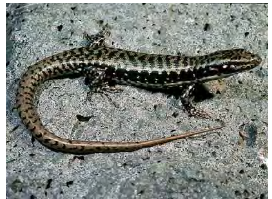
Corangamite Water Skink Eulamprus tympanum marnieae

The Corangamite Water Skink is restricted to Victoria. The subspecies is the only water skink occurring within the naturally treeless grasslands of south-eastern Australia. It inhabits a geographically peculiar Victorian landform, a