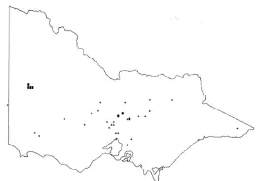
Distribution in Victoria (+ before 1970, ■ 1970 onwards) (source: Atlas of Victorian Wildlife , NRE 1998)