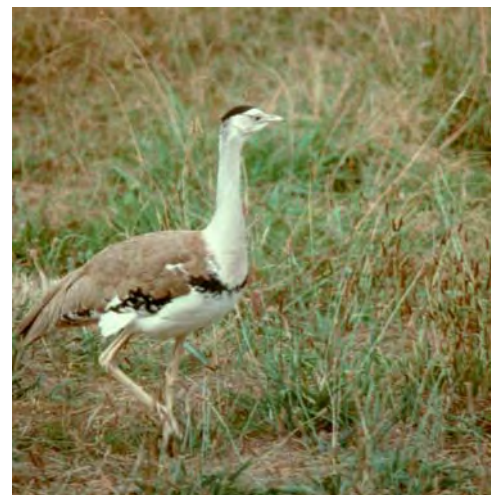
Australian Bustard ( Ardeotis australis )

The Australian Bustard was formerly widespread in suitable habitat in all mainland States but its range